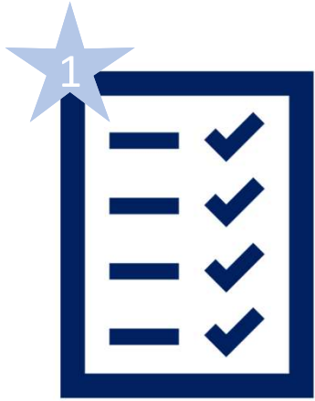
ELECTION SECURITY BEST PRACTICES GUIDE & DATA CLASSIFICATION SYSTEM